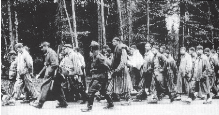
Prisoners marching through the town of Grünwald on April 29, 1945.

of the marches was to exterminate the prisoners in remote locations, in deep ravines concealed from the local residents. The confrontations and incidents between the air force officers and the officers of the guard units during the stopover at Bolzwang and in Devil's Valley, and the grave incident at Buchberg camp involving Otto Moll, lend substance to this explanation.