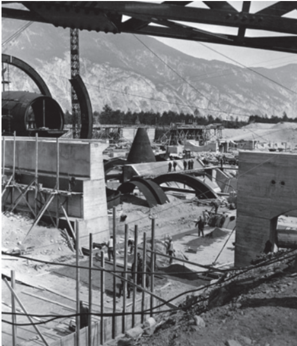
The foundations of the installations for the wind tunnels in the Ötz Valley (Ötztal) in the Austrian Alps, under construction in 1943.